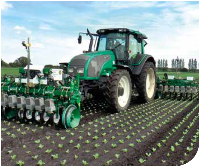
Optional eRotor model for minimum power, maximum speed!