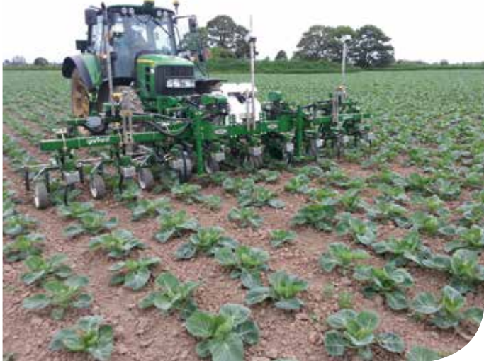
Robocrop InRow can continue to function even if some plants have grown into one another however for good reliable operation good plant separation is important