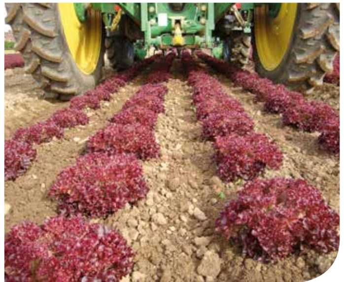
Robocrop InRow can be switched instantly between Green, Red and Infra-red colour modes.

Each camera can view a crop area of up to 2mtr wide. If wider working widths are to be accommodated then more cameras are mounted.