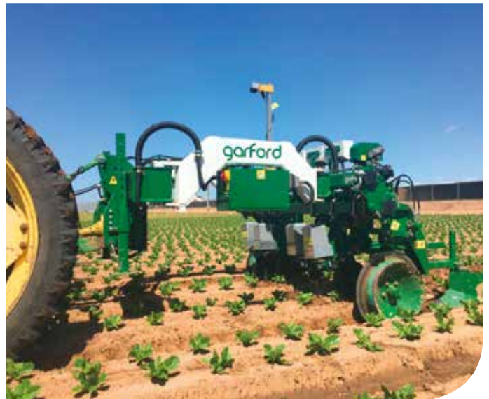
Front or rear mounting option for most crops