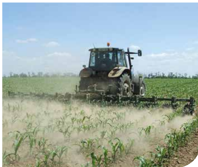
Robocrop enables large rear mounted cultivator to operate swiftly and accurately with reduced operator fatigue.