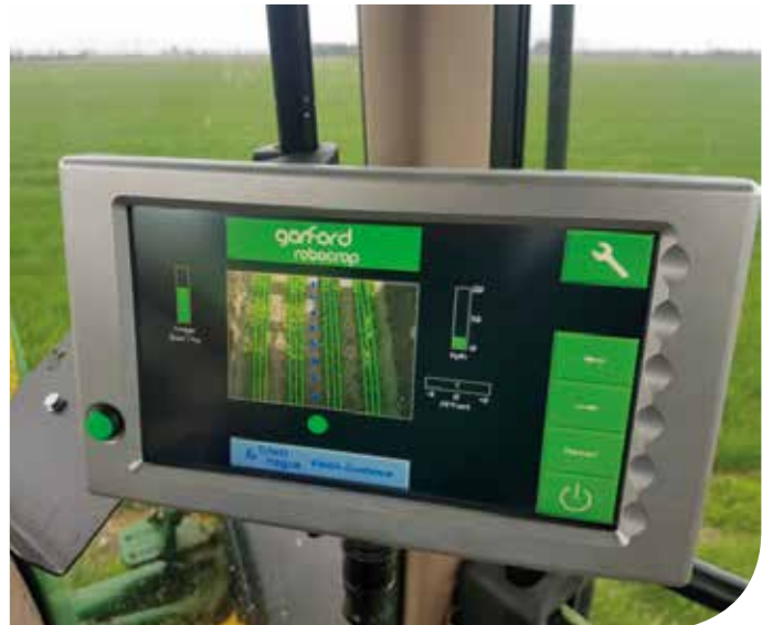
Simple and robust Robocrop console with touch screen controls