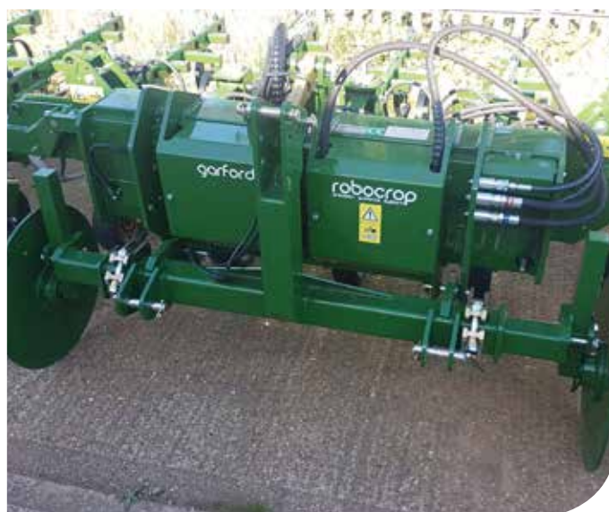
The compact hydraulic sideshift mechanism is available in Standard, Heavy Duty and Extra Heavy Duty for mounted hoes up to 18mtr

High Accuracy! High Speed! Reduced Operator fatigue!