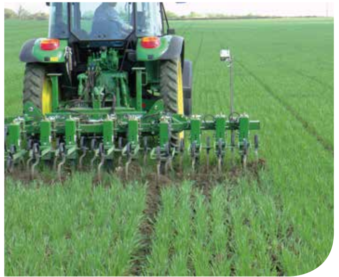
The Robocrop camera views numerous crop rows over an area of approximately 1.5mtr.sq.