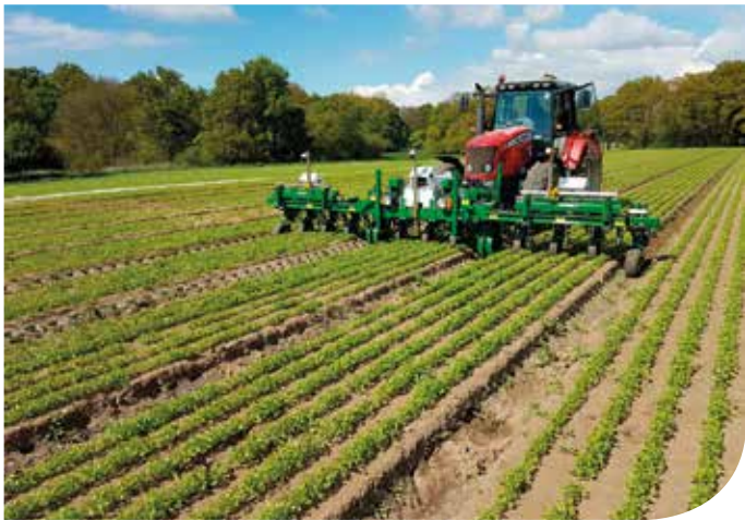
Multi camera, multi section types.