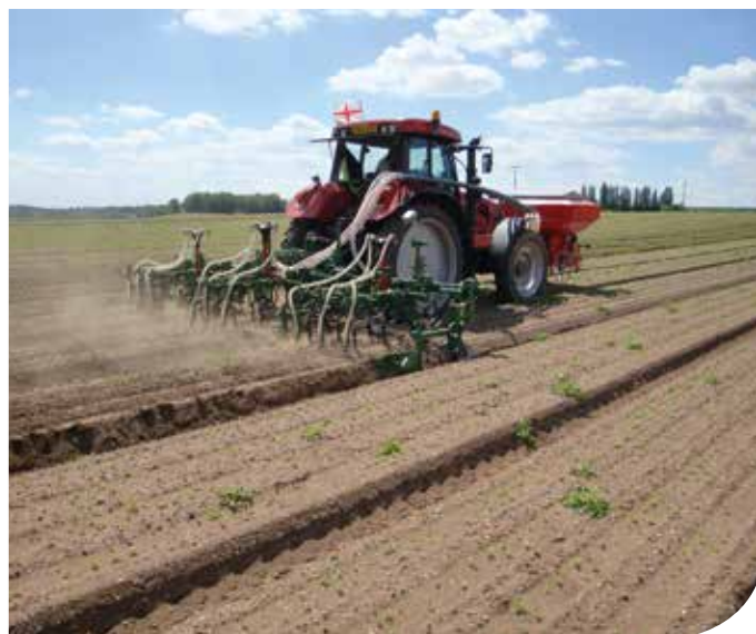
Fertiliser and agrochemical application equipment can be incorporated

High Accuracy! High Speed! Reduced Operator fatigue!