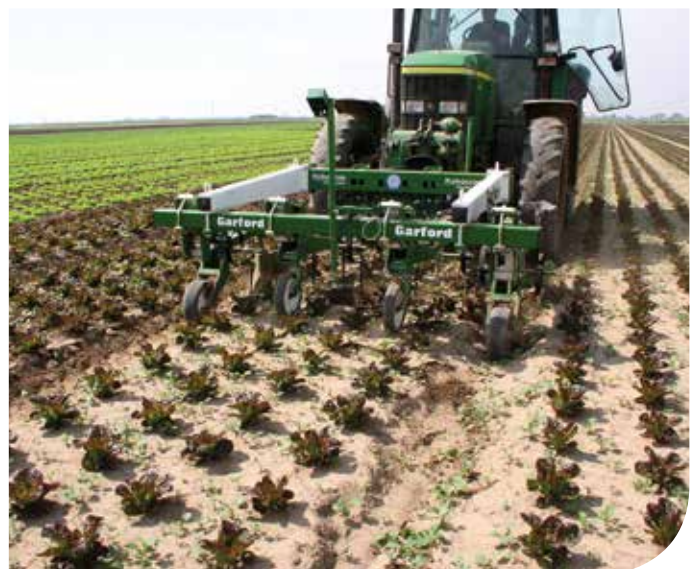
The custom colour feature enables operation on all crop colours