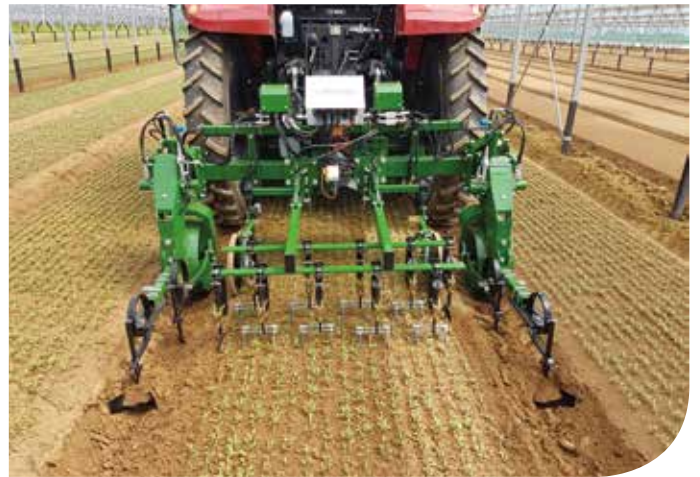
Ultra precise mini for roller seeder established crops.