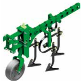
Parallel link wheel unit