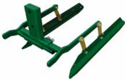
Crop protection shields