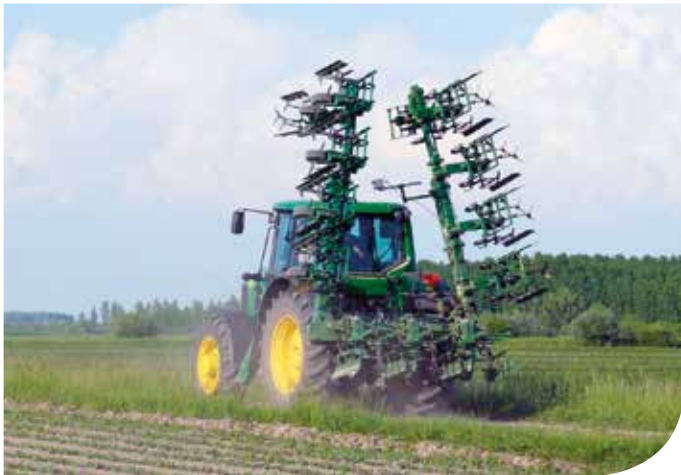
4.5 metre to 18 metre hydraulic folding frames

Garford can supply rigid or hydraulic folding frames up to 18 metre working width. Front mounted or rear mounted versions are available. A category 2 front linkage is available for frame sizes up to 6 metre.