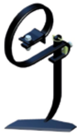
Adjustable S tine and slash share