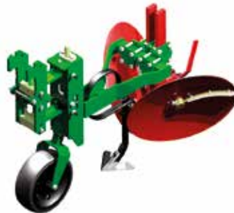
Parallel link wheel unit with Disc Ridgers