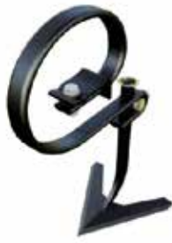
Adjustable S tine and flat A share