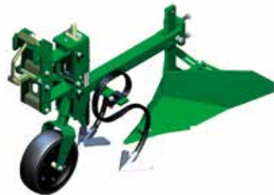
Parallel link wheel unit with Ridger body