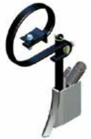
Adjustable S tine and fertiliser share