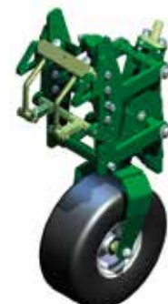
Heavy duty parallel link wheel unit