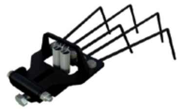
Spring Weeder Rake