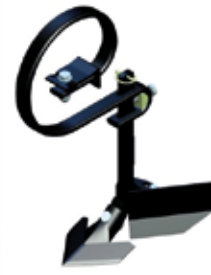
Adjustable S tine and hilling share