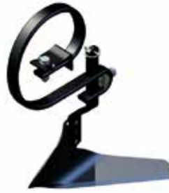
Adjustable S tine and swept L share