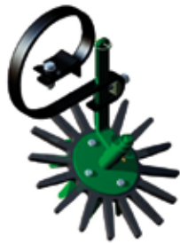
Rotary Finger Weeder