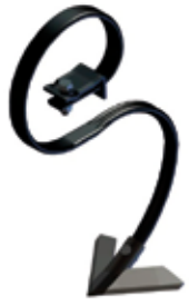
Traditional S tine and duck foot share