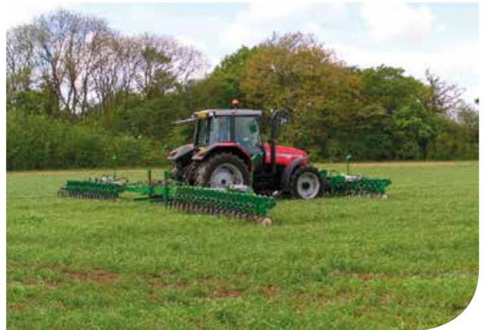
For larger systems, split front to rear systems give improved weight distribution